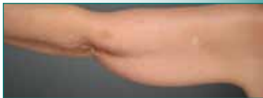
Arm before Tx