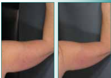
Upper arm before Tx Upper arm six months after VelaShape Tx