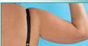
Arm before Tx