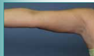
Arm after SkinTyte Tx