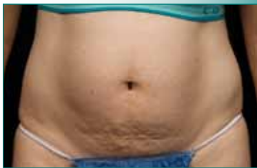
Abdomen before Tx