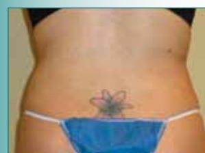
After SlimLipo Tx