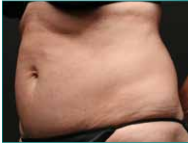
Abdomen before Tx