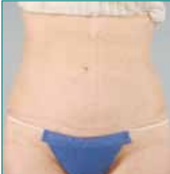
Abdomen one year after Smartlipo Tx