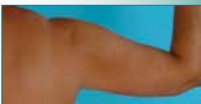
Arm after VASER Lipo Tx