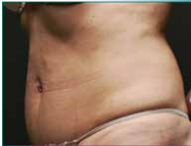
Abdomen six months after Thermage Tx