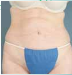
Abdomen before Tx