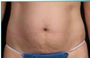
Abdomen three months after Thermage Tx