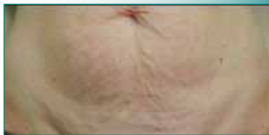
Abdomen after three Reaction treatments