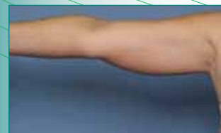
Arm before Tx