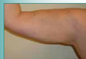
Arm two weeks after SlimLipo Tx