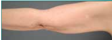
Arm five months after Smartlipo Tx