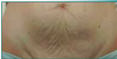
Abdomen before Tx