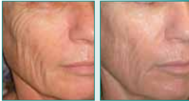
Before Tx After Reaction Tx