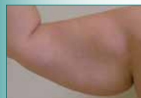
Arm before Tx