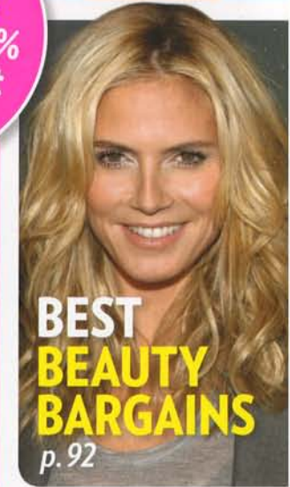
BEST BEAUTY BARGAINS p. 92