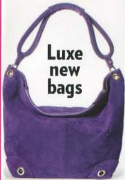
Luxe new bags